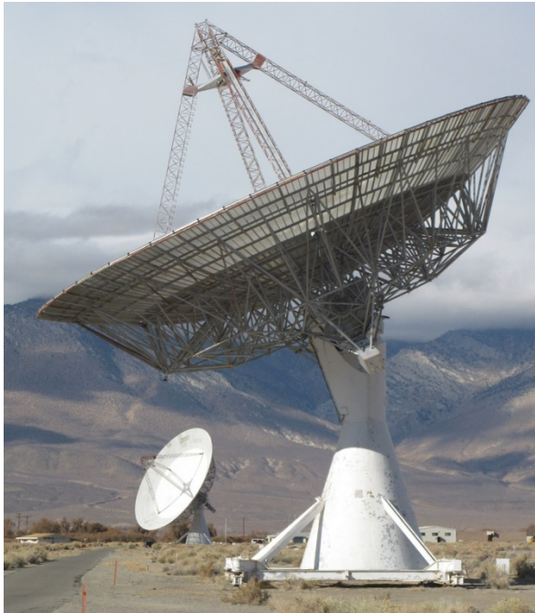
Figure 4: EOVS's 27-m antennas, used for calibration (and nighttime science).

The array size is 970 \times 1217 m, with maximum baseline of 1556 m, providing a maximum spatial resolution of 39.8''/f_{\text{GHz}} . Thus, the resolution at 18 GHz is 2.2'' (a factor of \sim 6 better than the Nobeyama Radioheliograph at 17 GHz). All EOVS data are processed in pipeline mode, where daily data products (dynamic spectra and images) are generated in near-real-time. Calibrated visibility data are also recorded for further off-line processing if desired. The pipeline processing steps are still being developed, but it is expected that daily, dual-polarization full-disk images will be produced at roughly 100 frequencies several times per day, while “partial-frame” dual-polarization images of flares will be obtained at 1-s cadence at >300 frequencies for the duration of the burst. Additional data products such as coronal magnetograms and F10.7 images and derived indexes will also be produced.