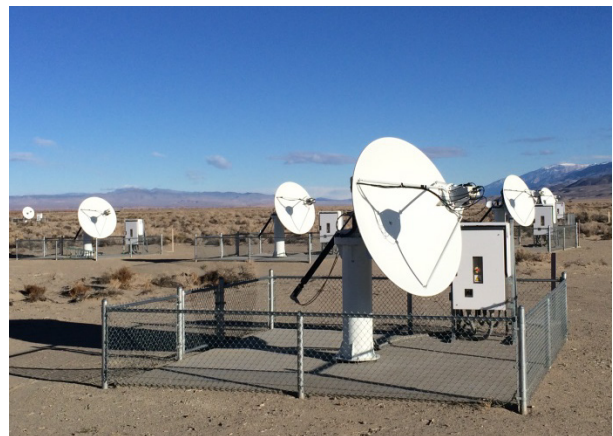
Figure 3: View of six of EOVSA's thirteen 2.1-m antennas.

The 2.1-m antenna size is chosen to permit full-disk coverage of the Sun at all frequencies, so that flares and active regions occurring anywhere on the Sun will be within the field of view. Hence, the antennas continuously track the center of the Sun. In addition, the radio receivers take advantage of new optical transmitter technology that permits the transmission