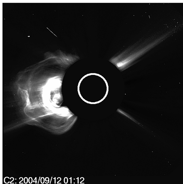
Fig. 1. LASCO C2 image of a limb CME that erupted on 12 September 2004. This image represents an event with a distinct three part structure and suggests that, at least some CMEs can be described as a flux rope structures.

Interplanetary counterparts of CMEs are called interplanetary CMEs (ICMEs) or interplanetary ejecta. The internal structure of an ICME is not trivial and may include an ICME body that is often preceded by a shock. The ICME body, in turn, may be observed as a complex ejection [16] or a magnetic cloud [MC, 17].